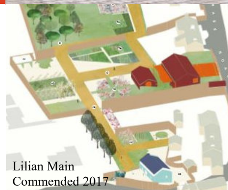
Lilian Main Commended 2017