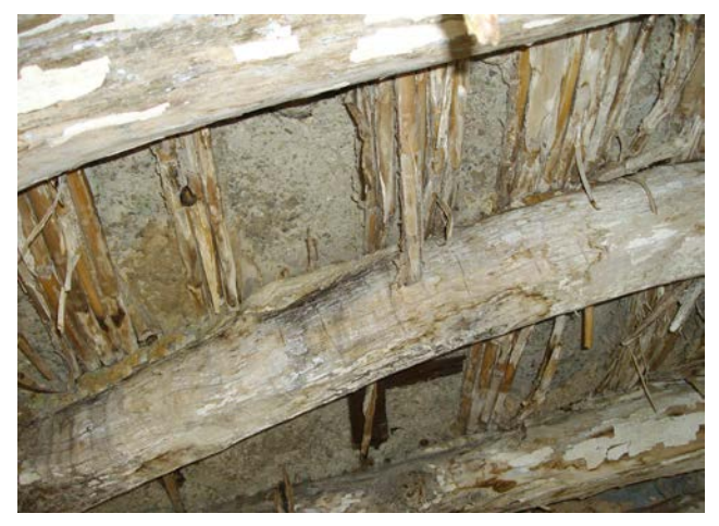
Figure 4: Cane bedding forming the underside of a historic gypsum plaster floor in Sierro, Andalucia, Spain.

It should be noted that various salt solutions can be added to gypsum to produce patent plasters. For example, Keene's Cement is made by burning gypsum that has been soaked in a solution of alum. This was sometimes specified for floors in the 19th century.