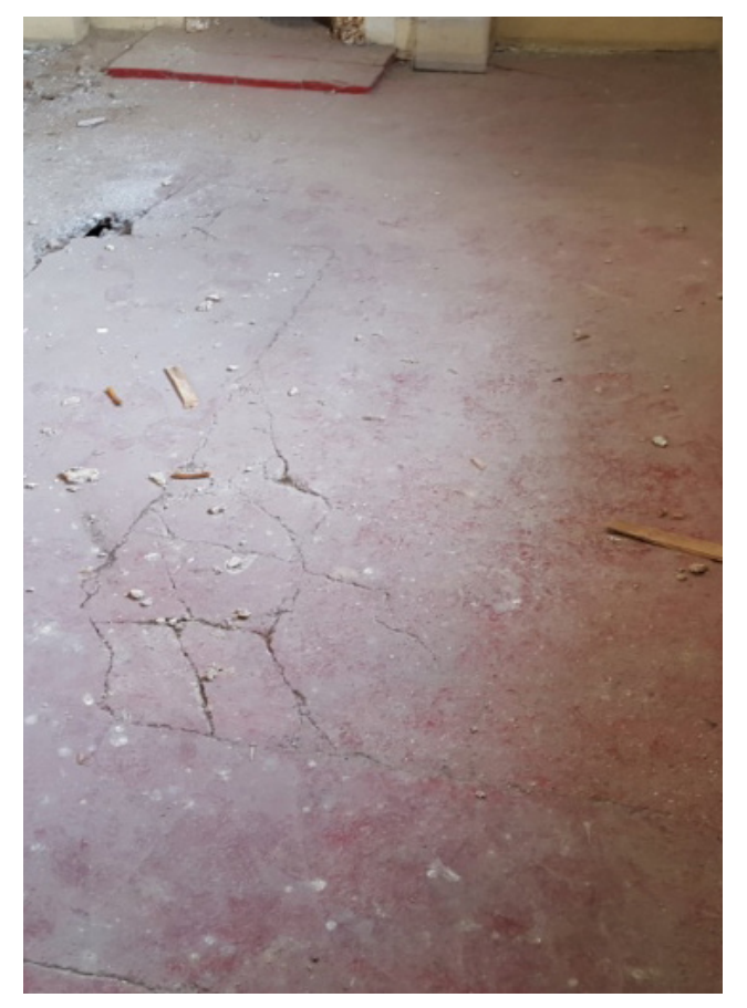
Figure 12: The nature and causes of defects should be clearlyestablished before carrying out work involving an old gypsumplaster floor.