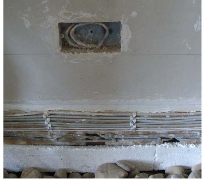
Figure 9: A stone base for a new gypsum plaster ground floor.