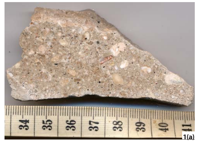
Figure 1: Samples of old gypsum plaster floors: (a) Typical colour and texture. (b) The varied composition found.

Depending on the constituents, the overall colour of gypsum plaster floors varies from creamy to a nondescript or dark grey, due