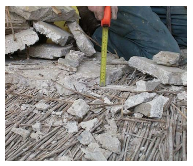
Figure 16: Old gypsum plaster that is removed should normally be retained for use as aggregate when laying replacement flooring.