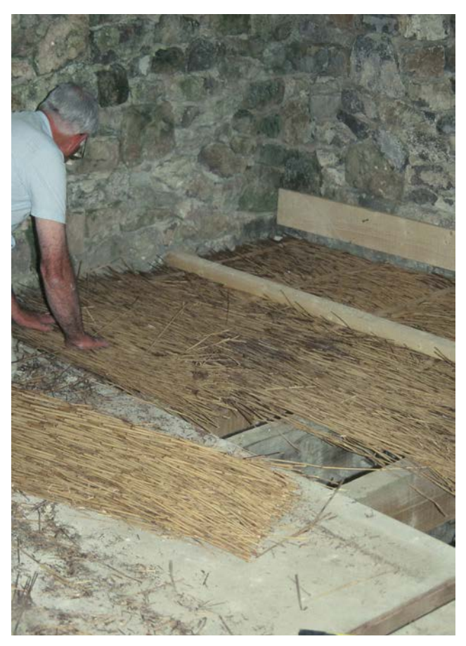
Figure 17: New reed bedding being laid.

It is generally unnecessary to reinstate lost bedding material where a section of ceiling is being replaced providing this is localised between joists and it does not provide the backing for a ceiling below. The plaster will usually span the joists safely and the underside can be concealed behind a new section of ceiling on separate lathing.