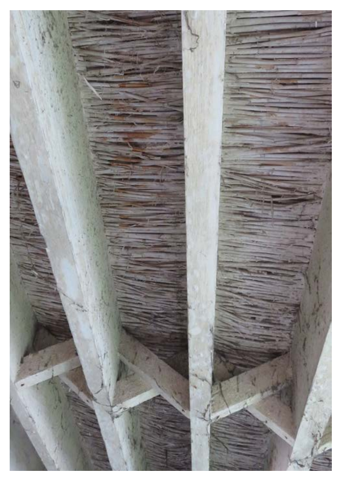
Figure 2: The presence of organic bedding material, such as reed, can indicate the existence of a gypsum plaster floor.

This Technical Advice Note considers next the history and construction of gypsum plaster floors (sections 2 and 3). A sound understanding of these aspects will help enable a proper appreciation of the significance of such floors. Good information on the history and construction of gypsum plaster floors also provides information essential for the analysis of any defects (section 4) and effective repair, the methods and materials for which are described later (sections 5 to 8) along with care and maintenance (section 9). Technical terms used in this guidance are defined in our online glossary.<sup>2</sup>