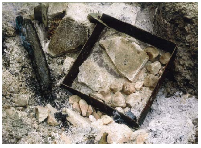
Figure 5: Trial gypsum-burning on an SPAB course.