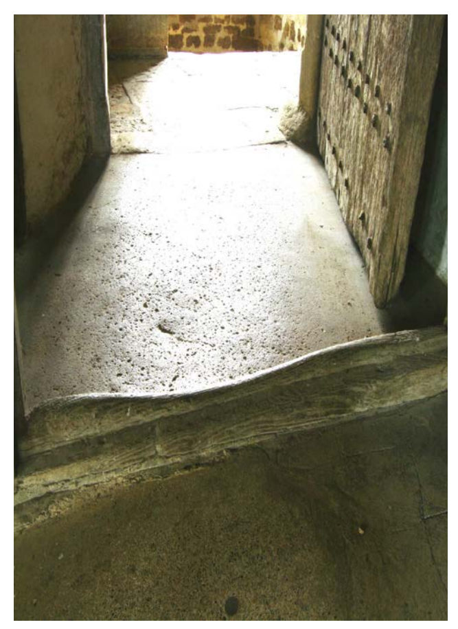
Figure 13: The special interest of an old building is best protected with conservative repair.