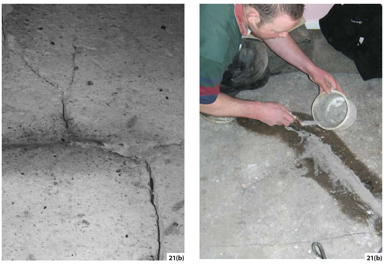
Figure 21: Cracking in gypsum plaster: (a) Raked out for repair. (b) Filled with a matching new mix.