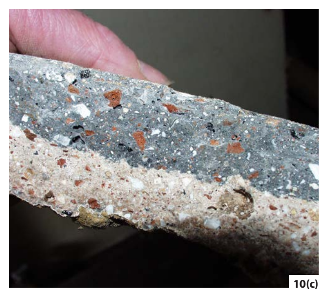
Figure 10: A historic solid gypsum plaster floor at Scraptoft,Leicestershire laid to imitate tiles: (a) General view. (b)Alternating black and white 'tiles'. (c) The two layers forming ablack tile.