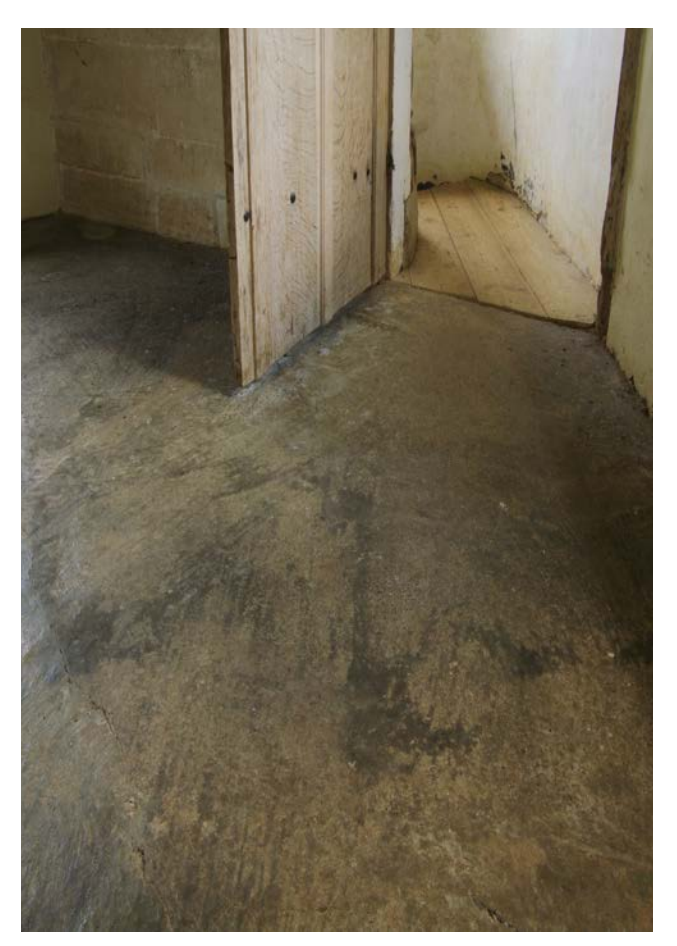
Figure 3: The patination from years of wear in a gypsumplaster floor at The Triangular Lodge in Rushton,Northamptonshire.