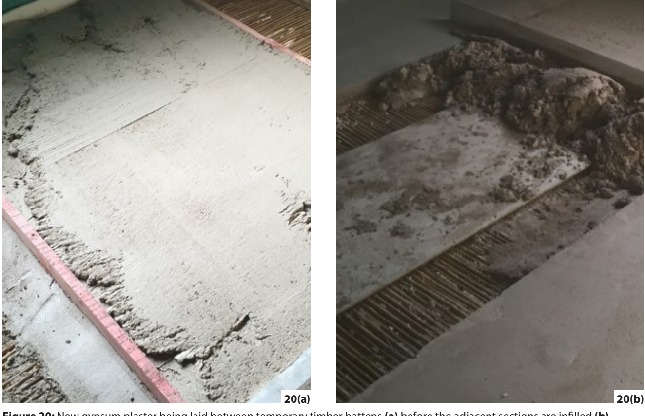
Figure 20: New gypsum plaster being laid between temporary timber battens (a) before the adjacent sections are infilled (b).

For larger areas, a reasonable amount of time will be needed for repairs, once laid, to cure and harden before they can cope with foot traffic and longer for loading, possibly from two to four weeks.