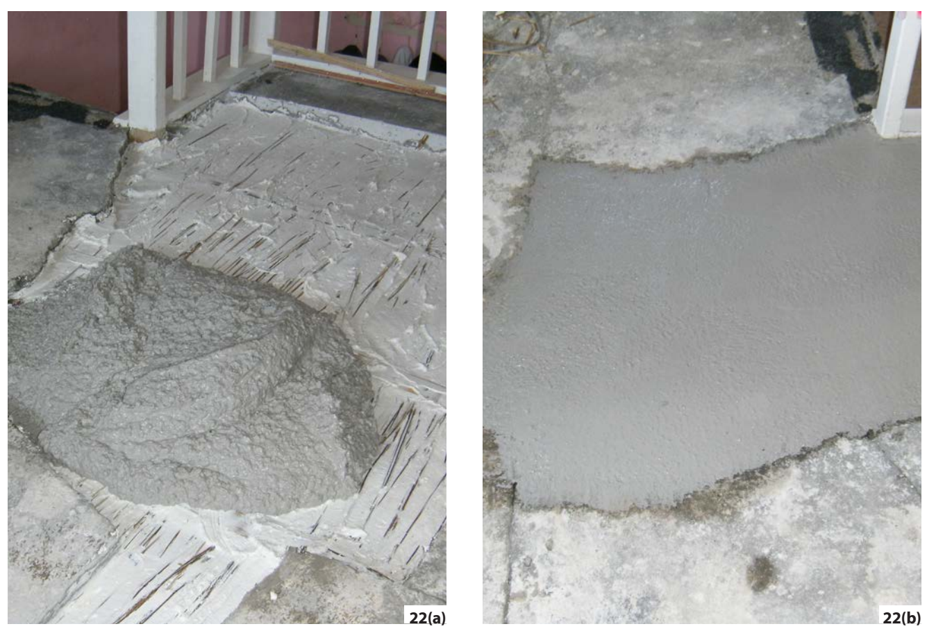
Figure 22: Patch repair: (a) New plaster being spread over a dressing of lime putty. (b) Finished level with the existing surface.