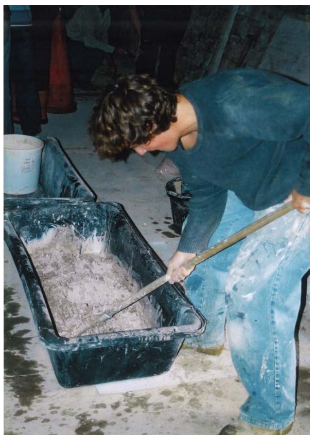
Figure 19: Mixing gypsum plaster in a plasterer's bath.

The main issue affecting the mixing of plaster for a floor is the volume of water required (before it is added to the blended aggregates). The water content for the plaster is found in the product information sheets but more may be needed for dry aggregates. This can be