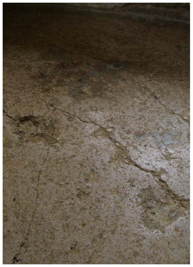
Figure 11: An old gypsum plaster floor may look beyond repairbut can frequently be brought back into a sound, functioningcondition.

Many old plaster floors are uneven and distorted but this does not necessarily indicate ongoing or recent movement causing damage that requires attention. Gypsum plaster floors can distort and crack for various reasons, leaving them more susceptible to abrasion, impact damage and, in extreme cases, collapse (see figure 12):