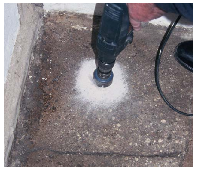
Figure 14: Drilling to remove a core sample of a gypsumplaster floor for laboratory analysis.

Be mindful of not inadvertently taking up a historic floor when removing a more recent concrete screed or slab on top of the plaster.