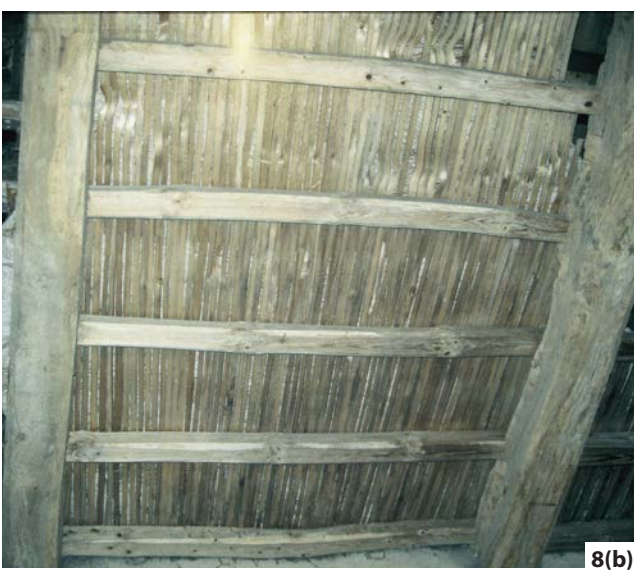
Figure 8: Organic bedding material: (a) Reed, as seen in a sample box cutaway. (b) Laths.