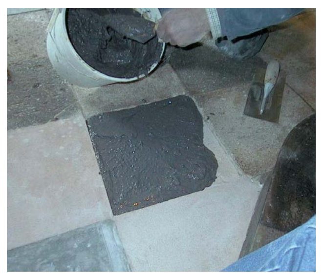
Figure 15: Materials and methods for repairs should match those of the original gypsum plaster floor as far as possible.

Where complete renewal is warranted, however, the opportunity could be taken to upgrade the performance of the floor, if appropriate. For example, the thermal properties of a ground floor, although adequate, can be enhanced further by laying the plaster over insulating loose fill rather than more conventional compacted hardcore or earth.