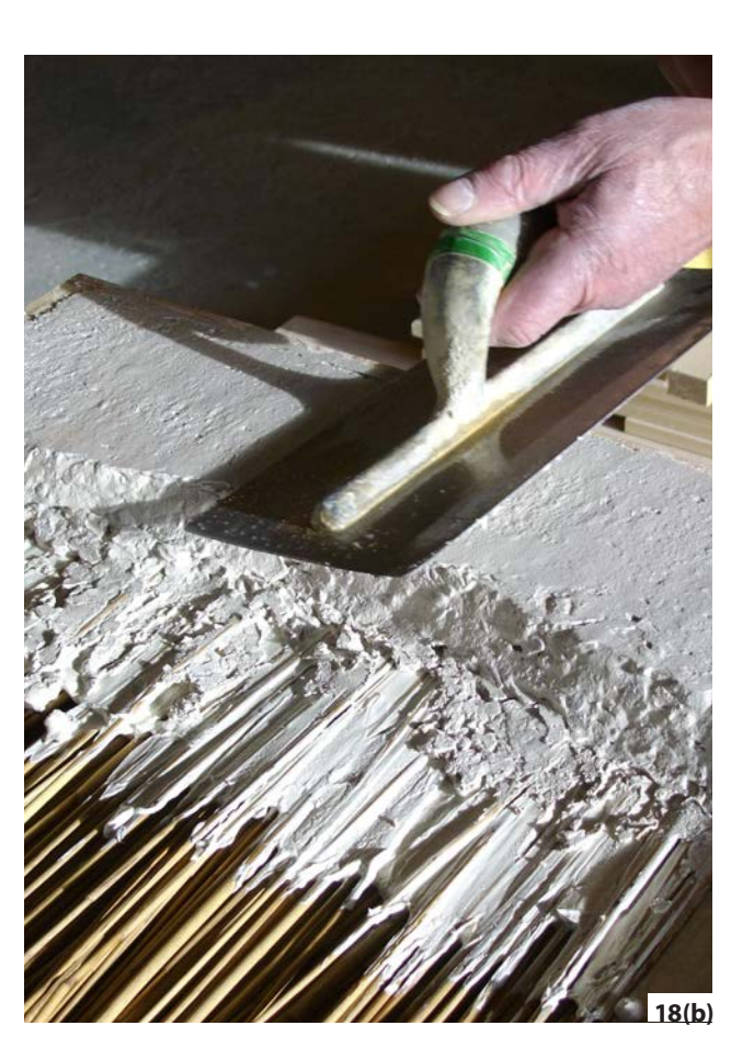
Figure 18: Bedding material being dressed with lime putty (a) over which, as in this demonstration, gypsum plaster is laid. (b) .